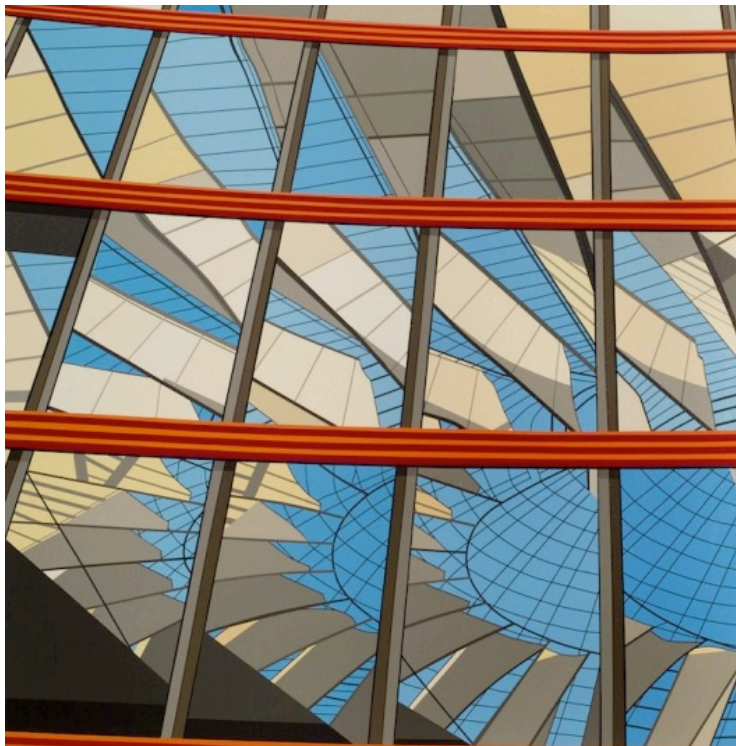
Sol Invictus, 2010 | Acrylic on canvas, 50 x 50 inches

I try to depict the skin of architecture as flat as possible with the use of acrylic paint and tape. Using this modernist hard edge language, I simulate illusionist space describes in the flattest of means. My paintings are complexity coupled with distortion. I want to present a clear but confusing image of the present – a type of crisis of perception.