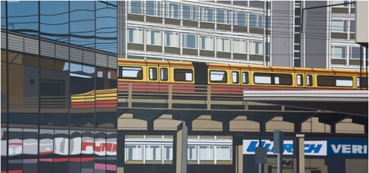
Above Ground, 2010 | Acrylic on canvas, 33 x 69 inches

TF: I think of the painting process as if it were a job. I work everyday and enjoy the early mornings the best. Music is a big part of the painting experience. I usually work on paintings one at a time and spend close to a month on each one.