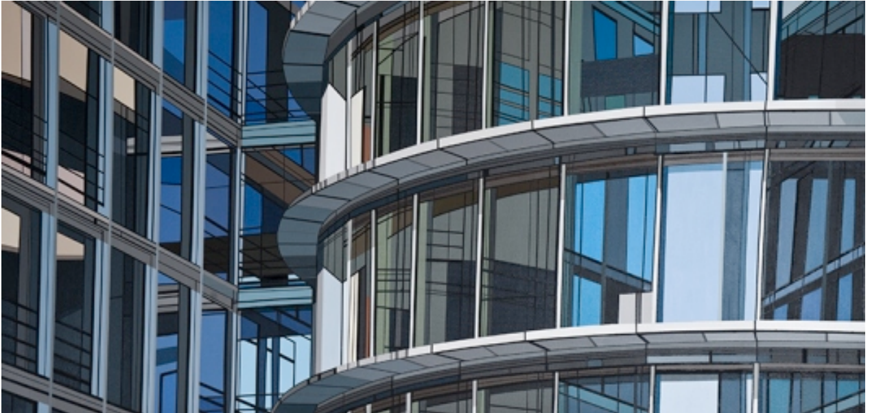
Western Exposure, 2010 | Acrylic on canvas, 33 x 69 inches