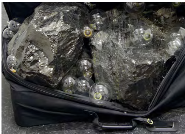
Demetrius Oliver, Albedo , 2010, anthracite, light bulbs, suitcase. 30 x 23 x 23 inches

Opening Reception Friday March 12 th , 6 – 8pm