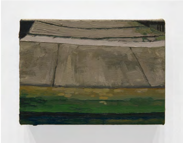
Charis Ammon Bayou Lines, 2022 oil on canvas on panel 5 x 7 x 1 in (12.7 x 17.8 x 2.5 cm) CA 204 $1,000