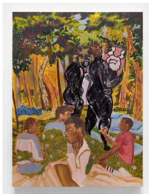
Alexis Pye, Be Like a Vase and Stay Awhile , 2023 oil, oil stick, oil pastel and embroidery on canvas 48 1/8 x 36 x 1 5/8 in

In Be Like a Vase and Stay Awhile (2023), we see a conjoining of two scenes: a family picnic in the foreground with two towering, female forms carrying a large vase in the background. The two standing women are abstracted “embodiments,” as Pye refers to them, while the figures in the foreground are sourced from Pye’s own family photos. For Pye, the vase is an allegory for the burden of femininity; while the object is somewhat cumbersome – being both large and without handles – the women are strong and capable, unconcerned with both the viewer and the characters in the foreground, their backs turned as they walk into the forest.