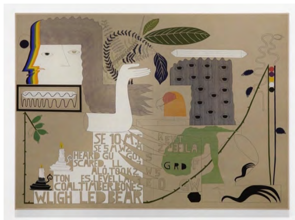
Shaun O'Dell Dissembling How to See the Mourning of a Carolina Parakeet , 2022 gouache and acrylic ink on paper mounted on canvas , 40 x 56 x 1 in (101.6 x 142.2 x 2.5 cm)

Using gouache and acrylic ink on toned paper, O'Dell references the colonial histories of his ancestors while highlighting the indigenous flora and fauna of the Cumberland Plateau region, where his family settled from Germany in the early 1800s. Using this taxonomy of objects, plants, and animals, the artist tried to step into the eyes of his ancestors and see what they might have seen, and also what they were blind to, arriving amid the colonial devastation of the people and forests of the region.