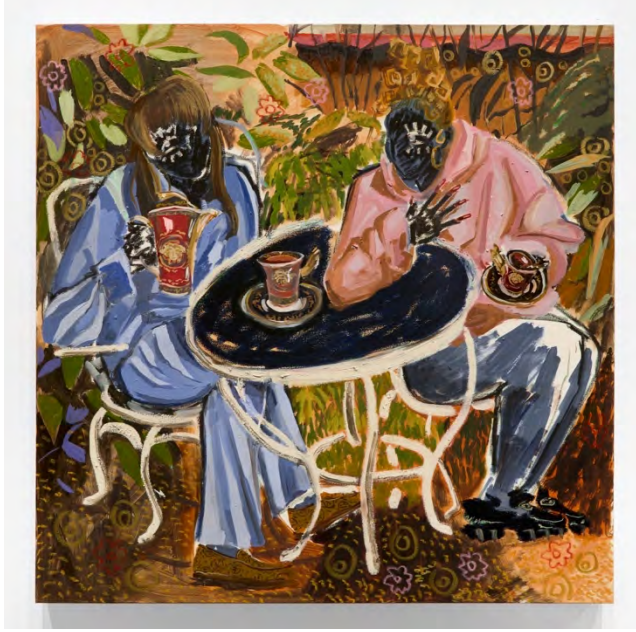
Alexis Pye, Spilled tea is not only a thing to clean up , 2023 oil, oil stick, oil pastel and embroidery on canvas 36 x 36 x 1 5/8 in

Spilled tea is not only a thing to clean up (2023) depicts two seated women, engaged in conversation as they share a pot of tea. The title, a play on words, points towards socialized roles of femininity in both labor and leisure: on one hand domestic care (cleaning tea that has literally spilled) and gossiping (the idiomatic, 'spilling tea') on the other. Here Pye comments on the performance and expectations of femininity beyond labor, including rituals of gossiping as a means of passing time and building comradery coming of age within a family. At this table we see the two women bonding over a pot of tea, their gestures actively engaged with one another as they listen.