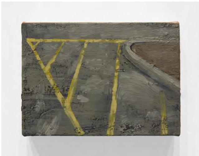
Charis Ammon Elbow, 2022 oil on canvas on panel 5 x 7 x 1 in (12.7 x 17.8 x 2.5 cm) CA 206 $1,000