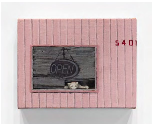
Charis Ammon Mattress Warehouse, 2022 oil on canvas 6 x 8 in (15.2 x 20.3 cm) CA 212 $1,200